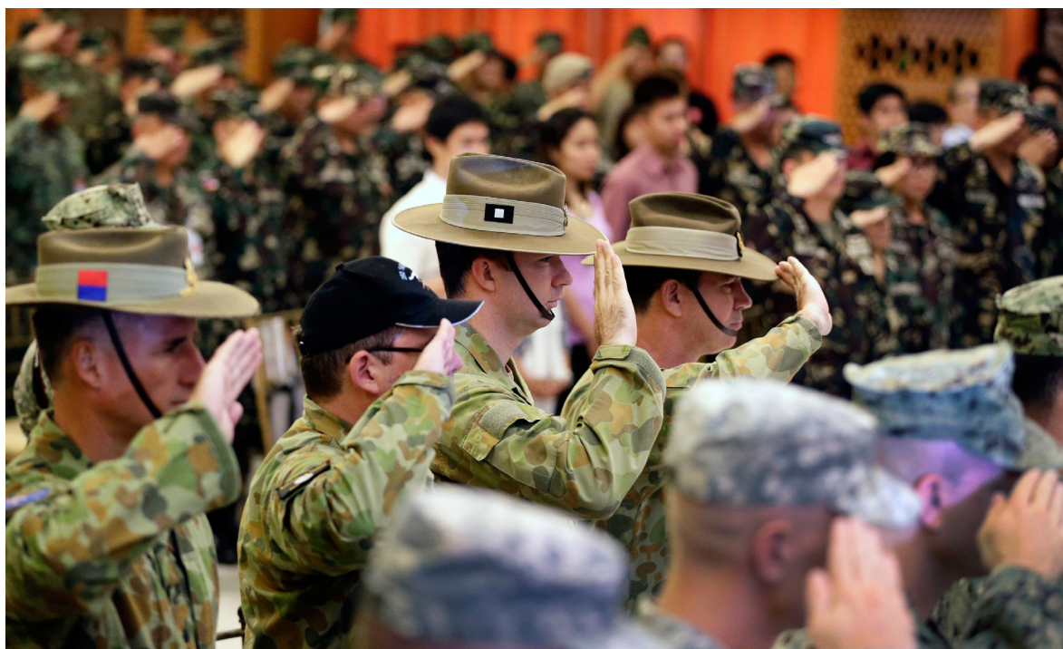
Australian soldiers (C) salute with military troops from the Philippines and United States during the ceremonial opening rites of the Philippines-US War Exercise inside a military camp in Quezon City, east of Manila, Philippines, 5 May 2014.

Adopting an explicit posture of military support for Manila's claims in the Spratlys and wider (self-defined) West Philippine Sea would significantly complicate diplomatic ties by reinforcing a perception in Beijing that the Australian Government is fully committed to working with Washington in strategically containing China in the Asia-Pacific. At best, this could complicate the consolidation of future economic and trade agreements; at worst, it could encourage China to search for new (non-Australian) sources of energy resources and alternative markets for its exports.