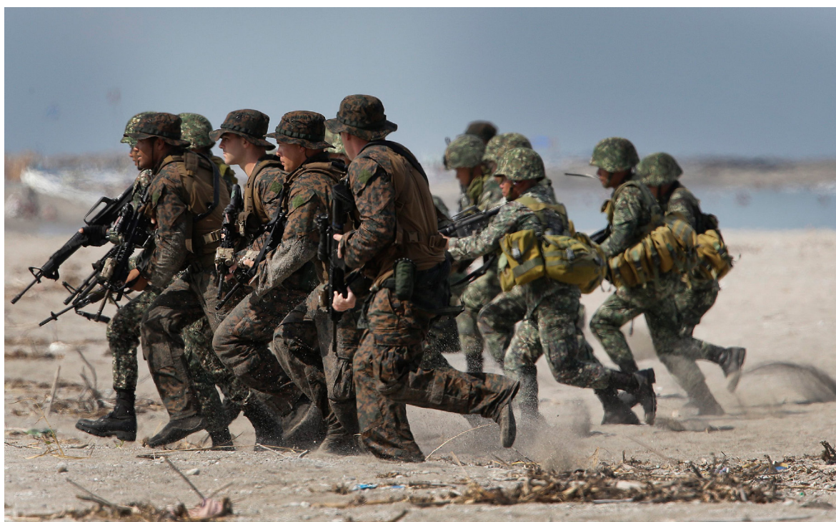
Filipino and US Marines manoeuvre during a mock 'beach assault' scenario as part of the US–Philippines joint military exercise in San Antonio town, Zambales province, Northwest of Manila, Central Philippines, 9 May 2014.

Clinton further declared that her government was fully prepared to help the GRP enhance its coastal and offshore capabilities and other aspects of expeditionary power. 63 That commitment was given concrete expression a year later when Washington announced that the Philippines would receive US$40 million in Global Security and Contingency Fund money in a new bilateral assistance program to enhance maritime domain awareness in the SCS and surrounding areas. 64