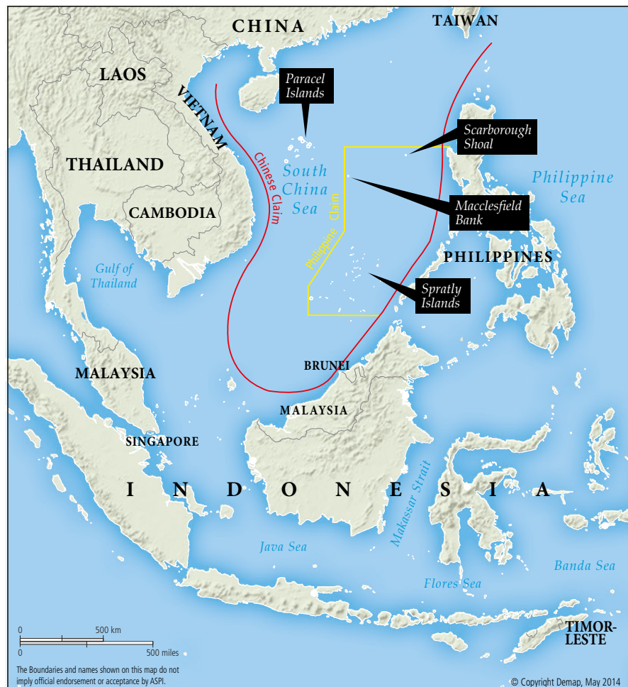
Figure 1: China and the Philippines maritime claims in the South China Sea

This assertive stance has brought it into direct conflict with the Philippines (as well as Vietnam, Malaysia and Brunei), as the wider maritime space China claims includes areas that fall well within Manila's EEZ. The most contentious region covers the Spratlys, which lie only a few hundred kilometres from Palawan and which were formally incorporated as part of the Philippines' territory in 1978 (as the 'Kalayaan Island Group'). 38